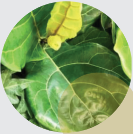
Low humidity in fiddle leaf fig leaves