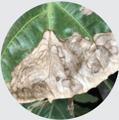
Dry fiddle leaf fig leaf