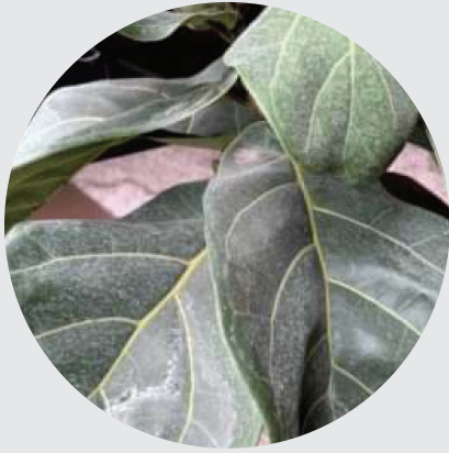
White spots on fiddle leaf fig leaves