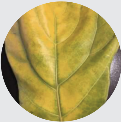
Yellow fiddle leaf fig leaf

Yellow fiddle leaf fig leaves can be caused by too much water, not enough light, or a lack of nutrients.