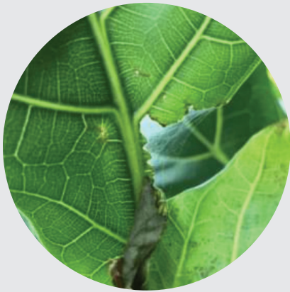
Spider mites on fiddle leaf fig leaves