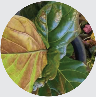
Sunburn on fiddle leaf fig leaves