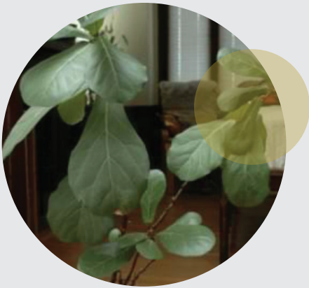
Droopy fiddle leaf fig leaves

Fiddle leaf fig leaves can droop because it needs water, it needs light, there has been a change, or it's burned.