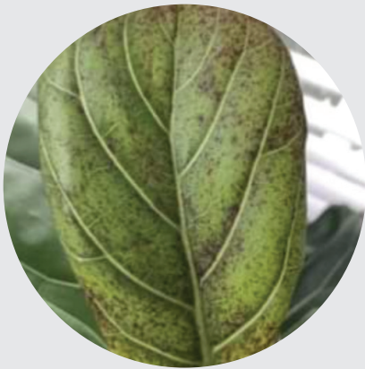
Edema on a fiddle leaf fig leaf